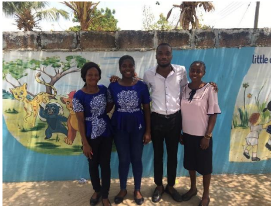
Guidance and Counselling Committee